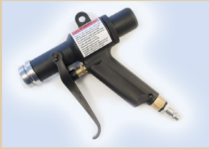
Turbo Striker item no.....096307