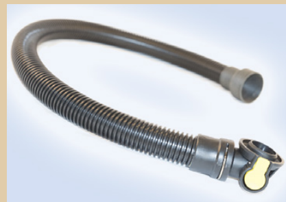
Hose for Striker Portable item no.....096310