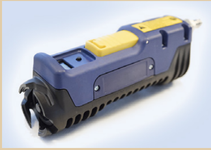
Digital inflator item no.....096302