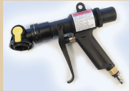
Striker inflator item no.....096304