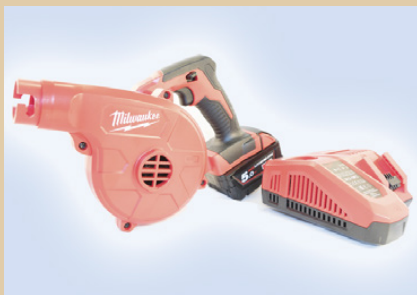
Striker Portable Inflator item no.....096308